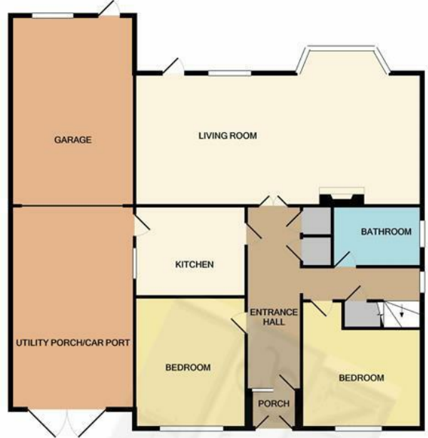
GROUND FLOOR APPROX. FLOOR AREA 1462 SQ.FT. (135.8 SQ.M.)