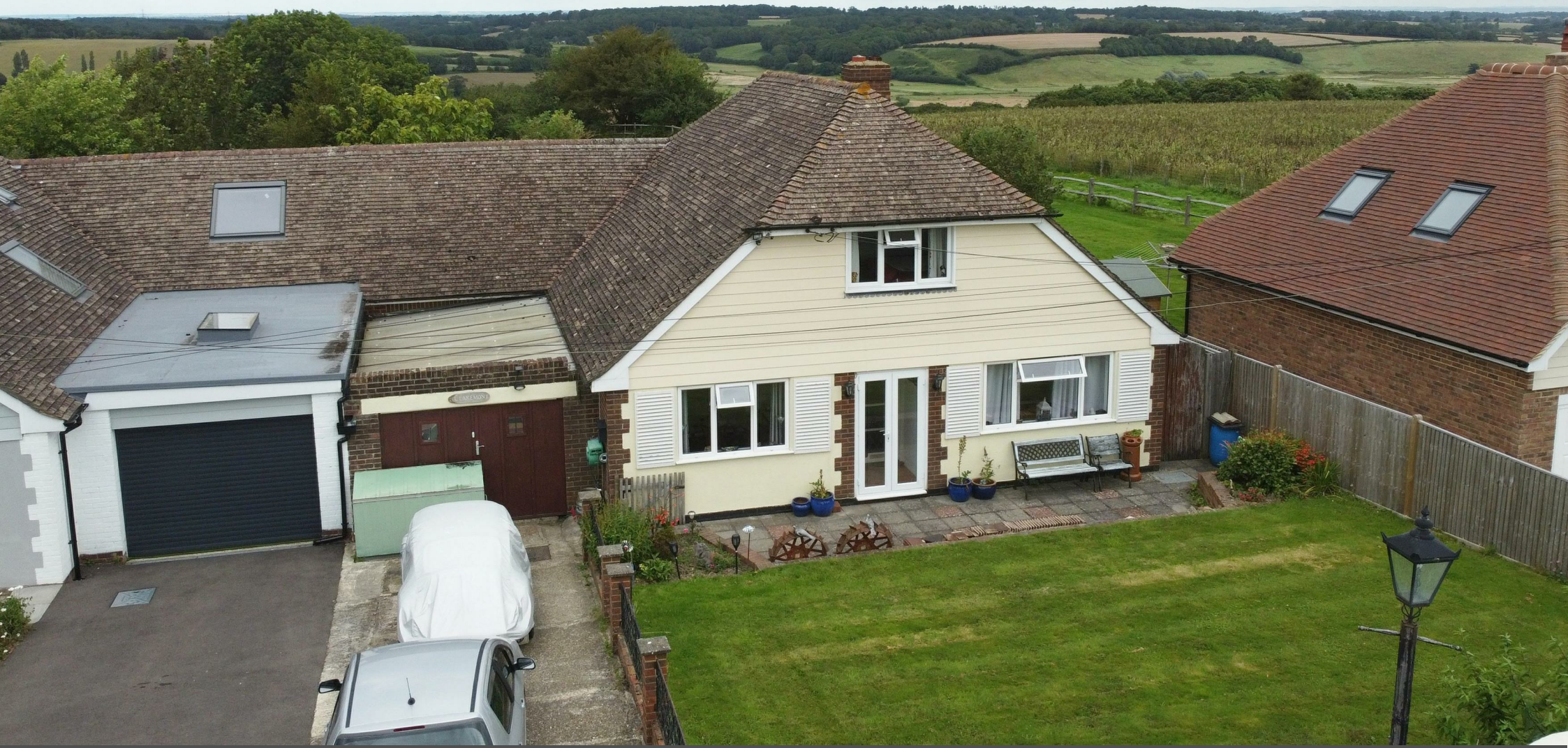
Claremont Udimore Road, Udimore, Rye, East Sussex TN31 6AY Guide Price £475,000