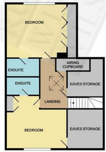
1ST FLOOR APPROX. FLOOR AREA 721 SQ.FT. (67.0 SQ.M.)